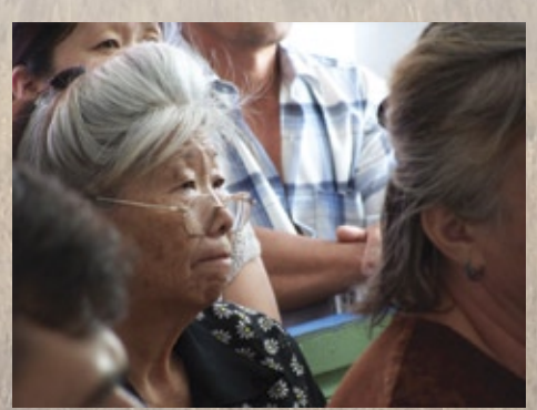
Listening intently during a church service

We are preparing to edit our film footage of the trip and will be producing a short DVD of the people and the services. Details on the availability of the film will be posted on our websites. Please remember these precious saints in prayer; it will be a pleasure to visit with them again in 2006.