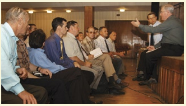
Left: Brothers discuss printing and distribution arrangements for Russian-speaking nations