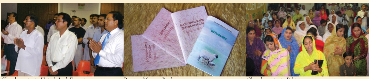
Church service in United Arab Emirates

On the mission field today, the pattern is exactly the same but things tend to happen today at a very fast pace. For example, in order to introduce the Message to Believers in a foreign country, one of the first steps involves having an open door into the country, looking for those interested in greater Truth. If a minister or layman arise who catch a revelation of this Truth, it