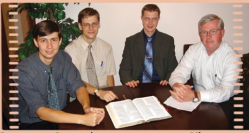
Interviewing Russian language interpreters in Ukraine

and minister's meeting. Following that trip, they will travel to Israel, and Arusha, Tanzania for meetings with the Believers of East Africa.