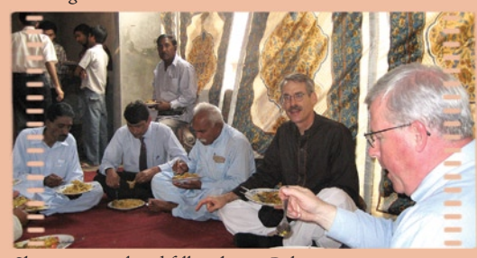
Sharing a meal and fellowship in Pakistan