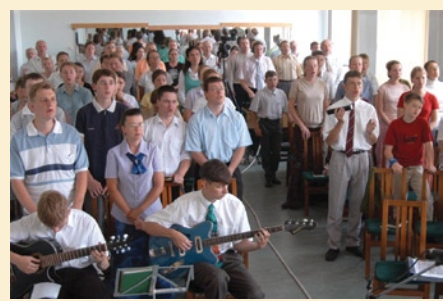
Youth camp service in Latvia

return of backslidden friends, healing of the sick, and other needs. How quickly the Lord began to respond to their prayers of faith! I am a witness that the revival prayed for was given, and that the Lord is drawing our wayward friends back to Himself. Leaving the camp, we didn't feel any of the post-camp blues, because each knew that the revival given us wasn't restricted to