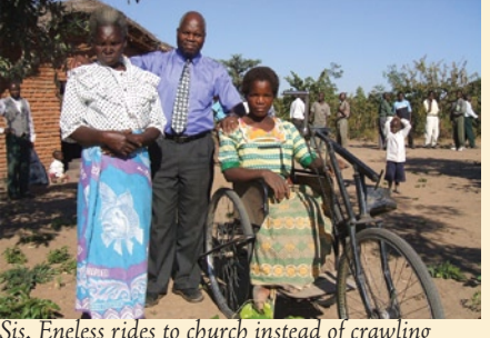
Sis. Eneless rides to church instead of crawling

My favorite parts of the trip were the meetings we held outdoors. It's wonderful to speak the Word to Believers, but it's an even more precious