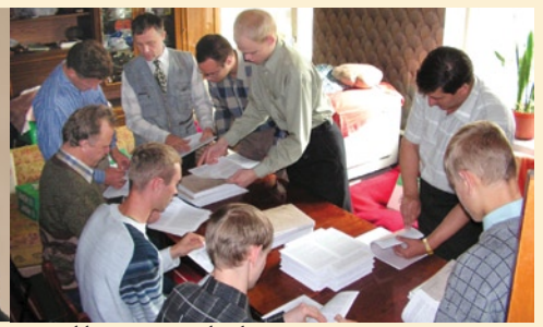
Assembling Message books in Russia