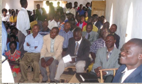
Church service in Milepa, Malawi Background photo: The road to Khosolo, Malawi

You know you're in a pretty I unique country when you're sitting in the airport of the capital city and you hear praise and