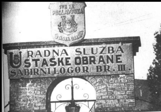
One of the entrances to Jasenovac Concentration Camp. The sign reads "Work Service of the Ustashe Defense Assembly Camp Nr. 3."