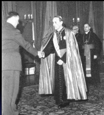
Stepinac shakes hands with Ante Pavelic, leader of the Nazi puppet state of Croatia

2. Why was Archbishop Stepinac not arrested immediately after the liberation of Yugoslavia?