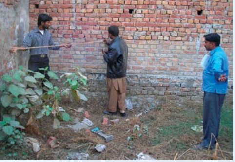
Measuring the land