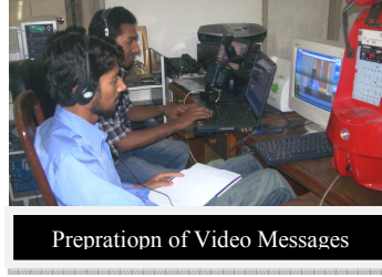
Preparation of Video Messages

few audios of the teaching sessions and prophet,s Message in urdu. Spread of Message is a reason we live and strive. We are praying and trying to run a Message Television, that shall serve a big community around. We need your prayers and support for this great work. Thanks much.