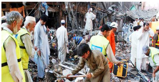
Damage after a bomb blast at Peshawar on Oct.28 th .

mile away from the place we had our meeting place. 119 people got killed in this deadly attack. Thanks God there was no harm towards saints in Peshawar.