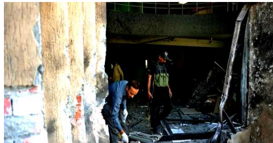
Pakistani Investigators after Islamabad suicide attack

The sweet voice of our MIGHTY EAGLE said "HE THAT DWELLETH IN THE SECRET PLACE OF THE MOST HIGH SHALL ABIDE UNDER THE SHADOW OF THE ALMIGHTY. I WILL SAY OF THE LORD, HE IS MY REFUGE AND MY FORTRESS: MY GOD; IN HIM WILL I TRUST.SURELY HE